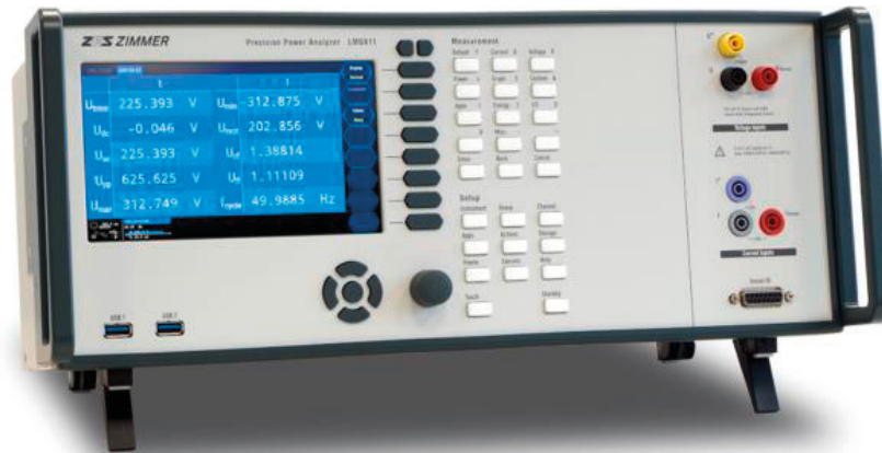
Fig. 4. LMG611.