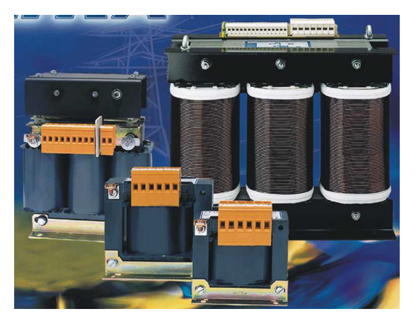
Picture 2: Filter circuit chokes as typical three-phase test specimens

The usual equivalent circuit diagram, consisting of loss resistance and reactance, is also no longer applicable. Only a magnitude value of the impedance, calculated from the effective voltage and effective current and the power factor describe the device under test. As the loss components contained in the power factor \lambda increase with different powers of the frequency depending on the physical cause, it is hardly possible to convert the losses to other frequencies and frequency mixtures.