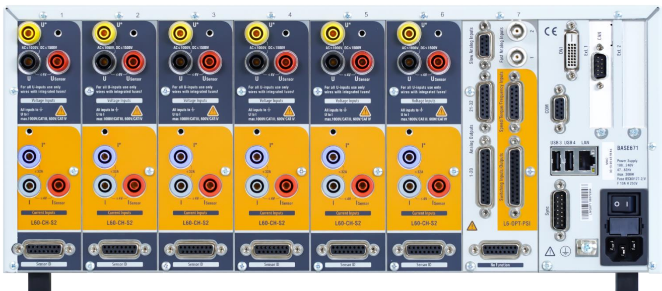
Figure 1: Rear Panel of the LMG671 equipped with 6 S-channels

Depending on the phase relationship between voltage and current, this ripple might contribute to overall power. While the magnitude of the contribution might be minor, when looking at efficiencies >95 % it can become significant.